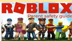
Parents guide to Roblox and how your kids can play it safely