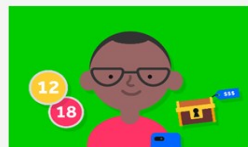
Gaming guide for Pre-teens 4 min read