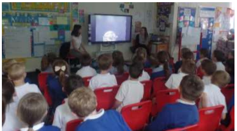
Watching a video of the 1969 moon landing.