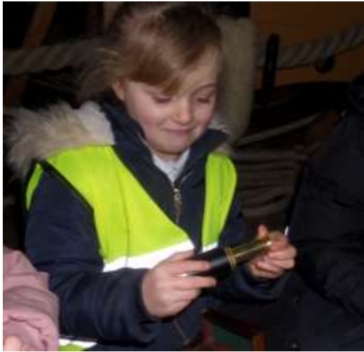
Visit to the Historic Dockyard in Portsmouth to learn about the HMS Victory and having the opportunity to handle and observe artefacts.