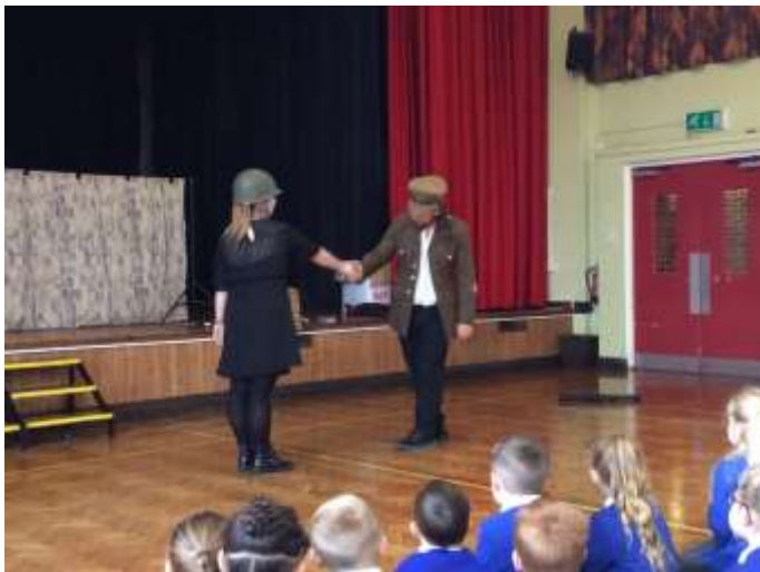
Children from KS1 taking part in a live "History show" to learn about the causes and impact of WWI in preparation for Remembrance Day.